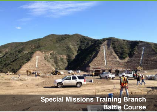
Special Missions Training Branch Battle Course