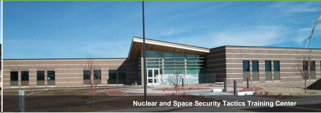
Nuclear and Space Security Tactics Training Center